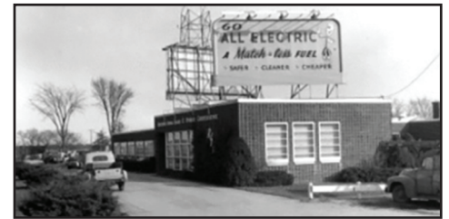
Wilton Service Center