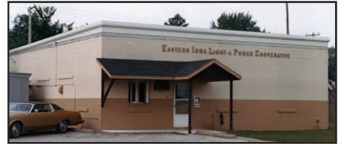
Lone Tree Service Center