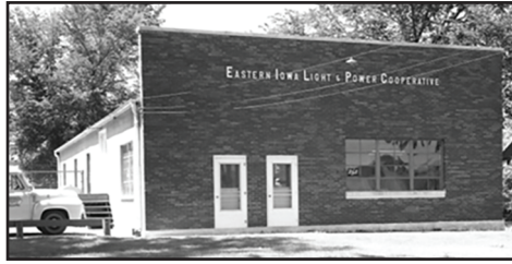
DeWitt Service Center

Tree in 1996; DeWitt in 2009; Wilton in 2015; and Wapello in 2021.