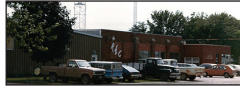
Wapello Service Center