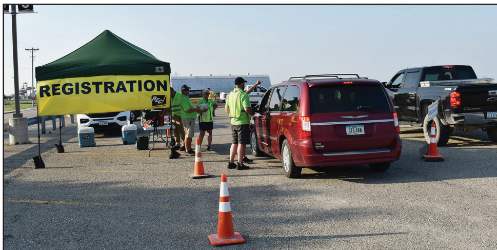
Eastern Iowa REC personnel registered members at the District 5 meeting in Mediapolis July 20, 2022.

The bottom portion of the registration letter, which will be sent to every Cooperative member, will be used for the official registration count and the