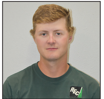
Clayton Cooling Apprentice Lineworker