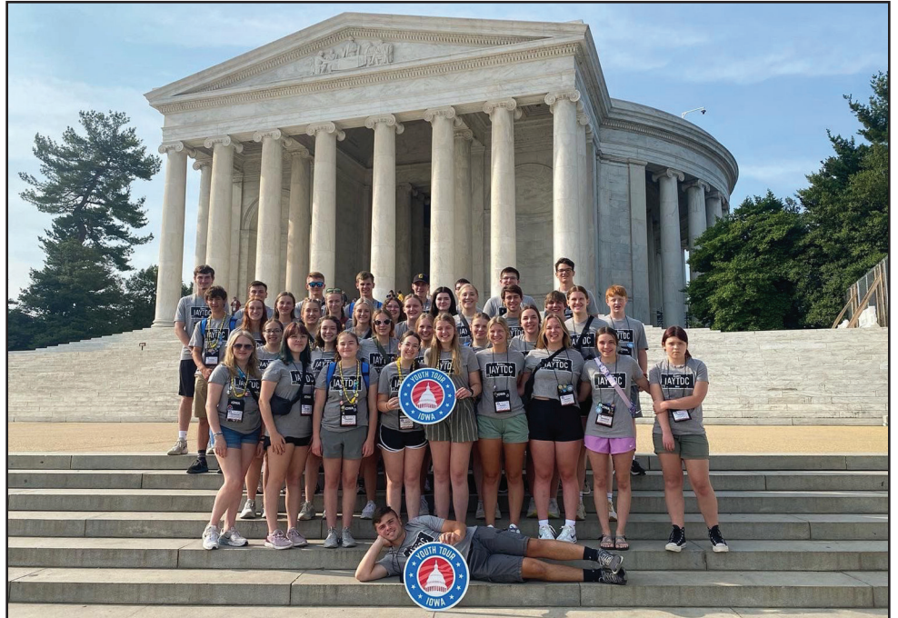
The 2023 Iowa Youth Tour group visited the Jefferson Memorial among the many sites they saw while in Washington, D.C.

All 2024 Youth Tour applications are due by March 15, 2024.