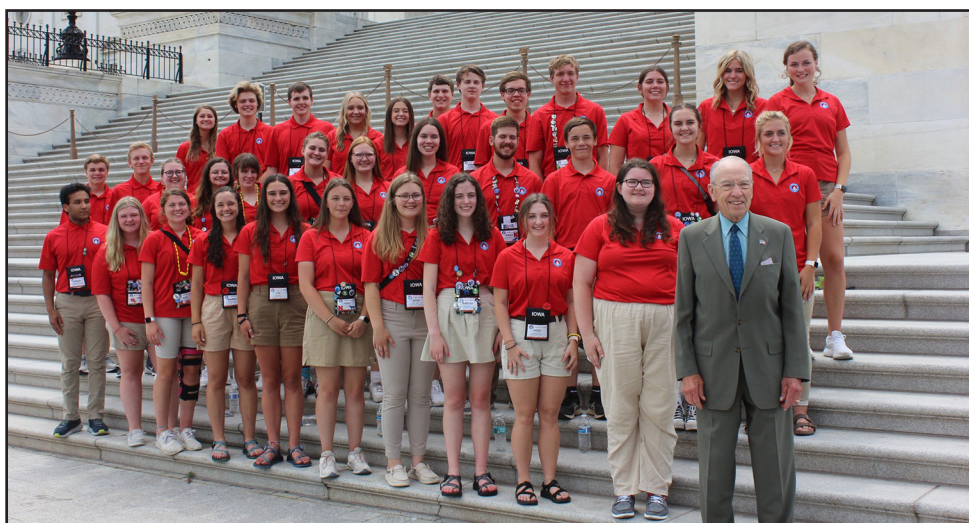
The 2022 Iowa Youth Tour group was able to meet with Sen. Chuck Grassley while in Washington, D.C.

All 2023 Youth Tour applications are due by March 17, 2023.