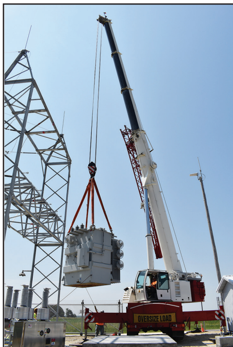
The new Sperry Substation transformer will improve the reliability and capacity of this facility.