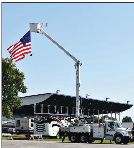
The flag will be flying over the 88th Eastern Iowa REC annual meeting Sept. 7 at the Mississippi Valley Fairgrounds in Davenport.

The registration area can be found in the north end of the Fair Center Building.