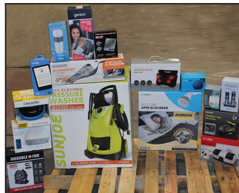
These prizes and more will be moved from the Cooperative's warehouse to the Mississippi Valley Fairgrounds in Davenport in time to be awarded during the annual meeting Sept. 7.