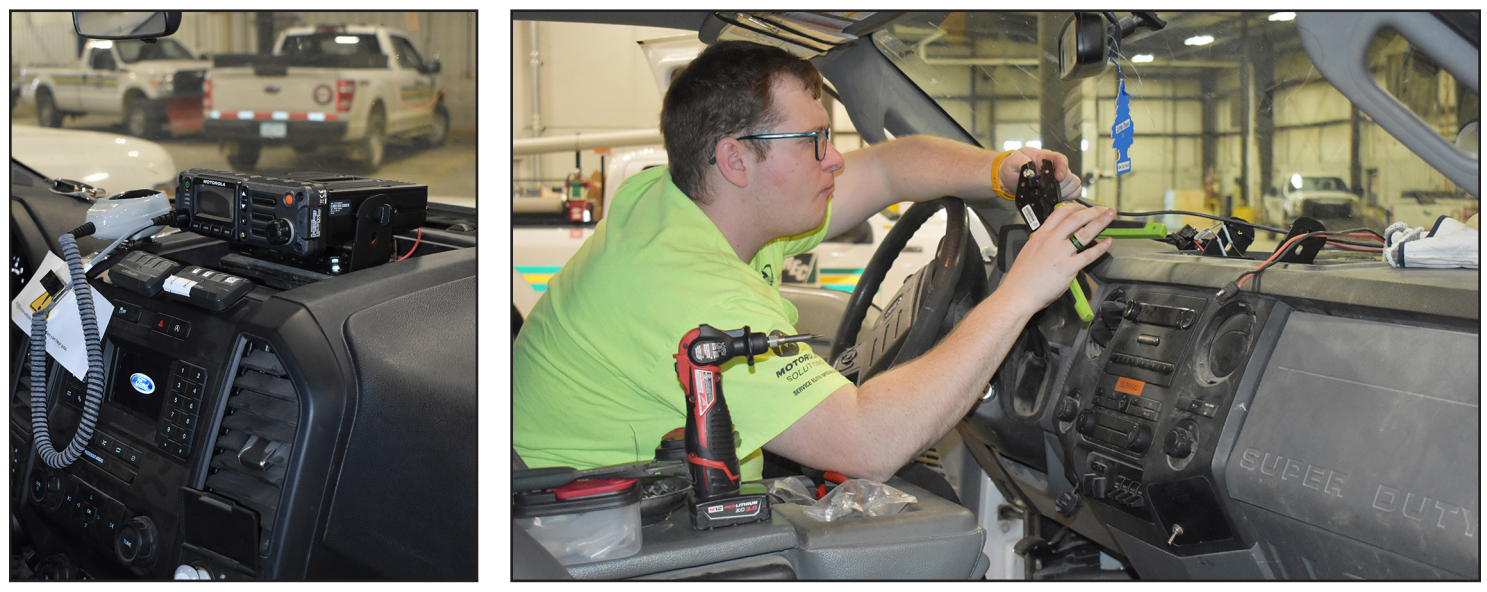
Earlier this year, technicians installed new radios in Cooperative vehicles as part of the project to switch the organization's two-way radio system to the Iowa Statewide Interoperability Communication System (ISICS).